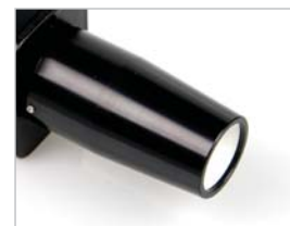
Close focus module