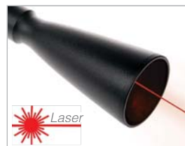
Long range module