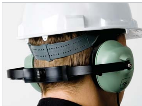
Headset designed for hardhat use