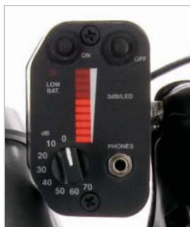
LED display and sensitivity dial