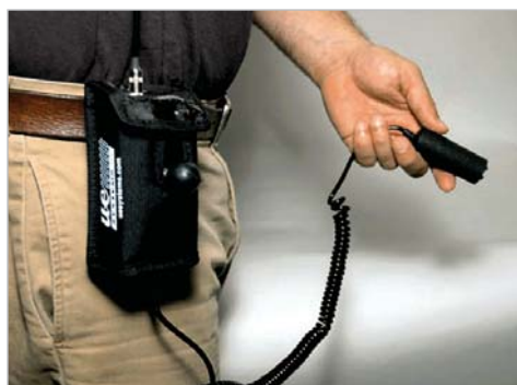
Holster for UP 201