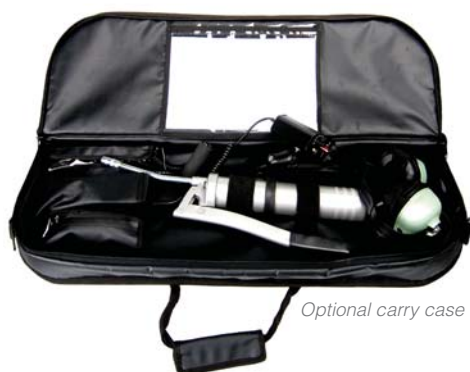
Optional carry case